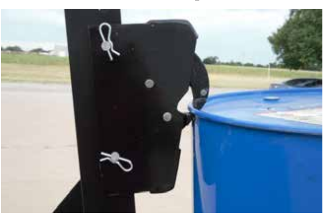
Head automatically grips the ring of the drum as you lift up the handler