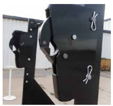
Dual Grip Jaw Heads

With the Grip-O-Matic, drum handling becomes simply—a safe, one-man task, easily accomplished . Ideal for narrow aisle operations, this drum handler takes up little more space than the drum itself. Fork mounted models are best suited for intermittent handling of drums as they can be removed quickly from the forks; but for continuous drum handling, the carriage-mounted Grip-O-Matic is the best choice since it reduces the overall length of the truck, permitting greater maneuverability and handling ease.