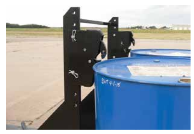
Drive up to the drum and lower the heads over top ring on the drum