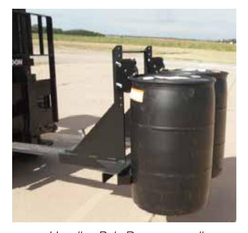
Handles Poly Drums as well as steel & fibre drums