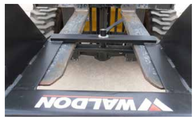
Drum handler attaches to the forks with 3/4" thick bar