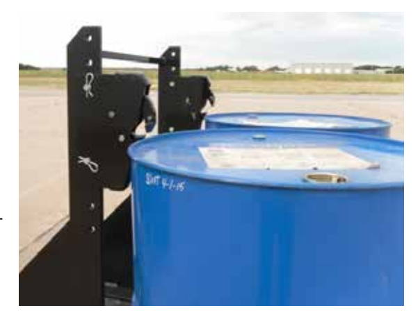
GF5502 – Grip O Matic Double Drum Handler

jaws automatically open and close during the pickup operation, gripping the rim of the drum. As the truck mast is tilted back, the pressure of the drum weight causes the steel jaws to lock, securing the drum for transport—the heavier the drum, the tighter the grip. The drum is released by setting it down and backing away.